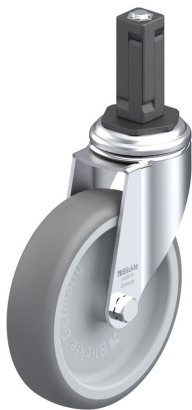
Corresponding swivel caster LKRA-TPA 126G-11-EV13