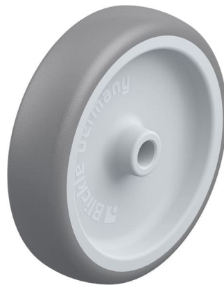
Wheel used TPA 126/12G