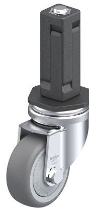
Corresponding swivel caster LRA-TPA 50KF-EV03