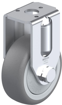
Corresponding rigid caster BRA-TPA 50KF