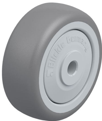
Wheel used TPA 50/6KF