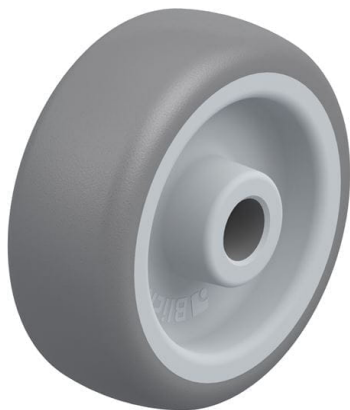
Wheel used TPA 50/8G