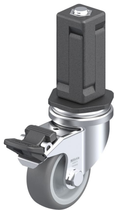
Corresponding standard locking LRA-TPA 50G-FI-EV04