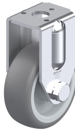
Corresponding rigid caster BRA-TPA 50G