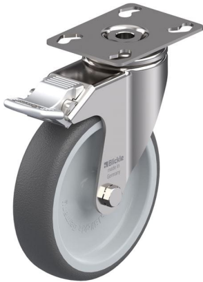
Corresponding standard locking LKPXA-PATH 126G-FI