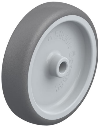
Wheel used PATH 126/12G