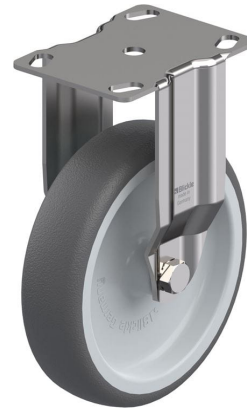
Corresponding rigid caster BKPXA-PATH 126G