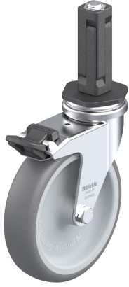
Corresponding standard locking LRA-TPA 100G-FI-EV02