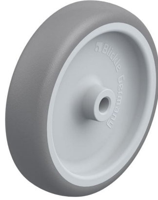
Wheel used TPA 100/8G