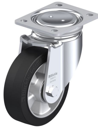
Corresponding swivel caster LUH-ALEV 150K