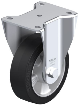
Corresponding rigid caster BH-ALEV 150K