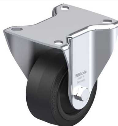
Corresponding rigid caster BK-POEV 82KF