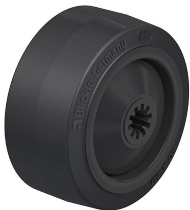
Wheel used POEV 82/8KF