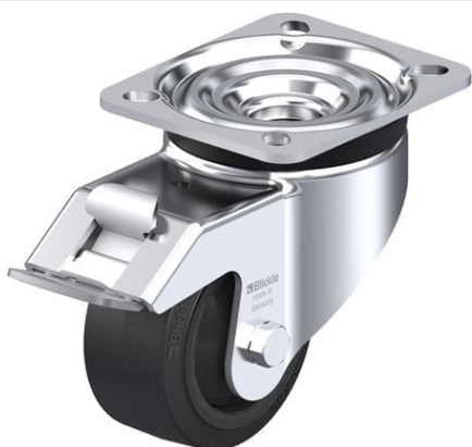
Corresponding standard locking LK-POEV 82KF-FI