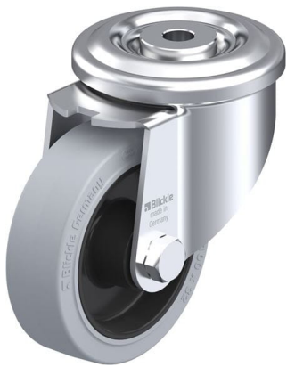
Corresponding swivel caster LKR-POEV 100R-SG