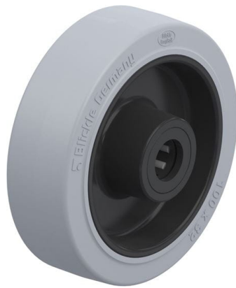
Wheel used POEV 100/15R-SG