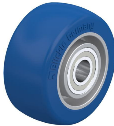
Wheel used ALBS 82/15K