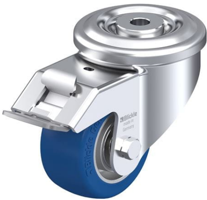
Corresponding standard locking LKR-ALBS 82K-FI