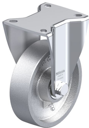
Corresponding rigid caster BH-G 125K-1