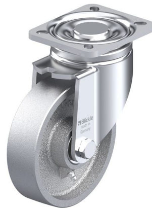
Corresponding swivel caster LH-G 125K-1