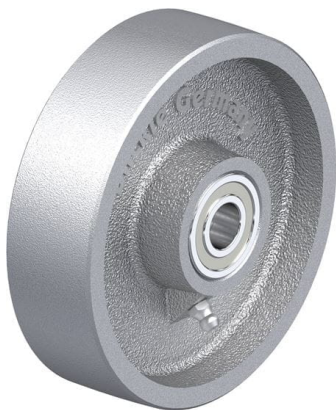
Wheel used G 125/15K