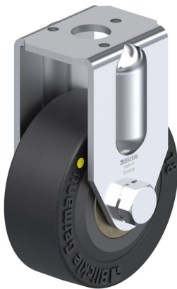
Corresponding rigid caster BRA-VPA 50K-EL