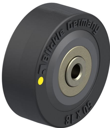
Wheel used VPA 50/6K-EL