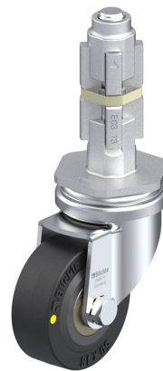
Corresponding swivel caster LRA-VPA 50K-EL-E03