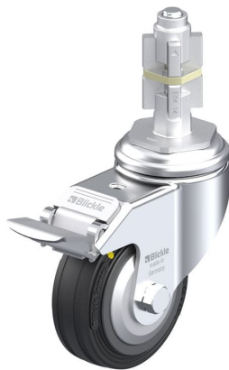
Corresponding standard locking LKRA-VPA 80K-11- FI-EL-FA-E14