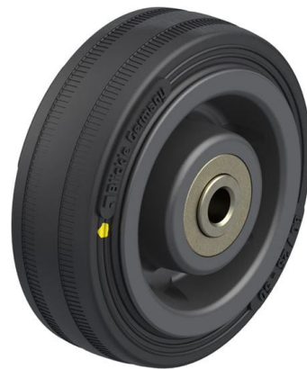
Wheel used VPA 80/8K-EL