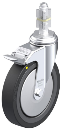
Corresponding standard locking LKRA-VPA 150K-11-FI-EL-FA-E14