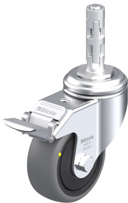
Corresponding standard locking LKRA-TPA 80KF-11-FI-ELS-E1