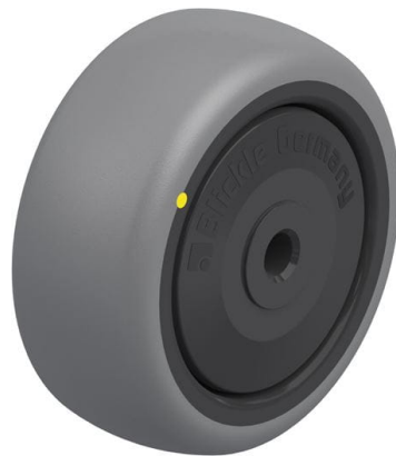
Wheel used TPA 80/8KF-ELS