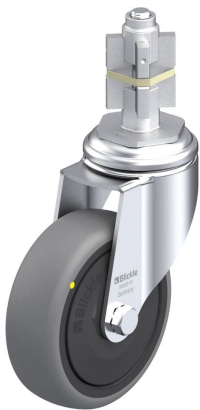
Corresponding swivel caster LKRA-TPA 101KF-11-ELS-E15