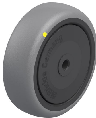
Wheel used TPA 101/8KF-ELS