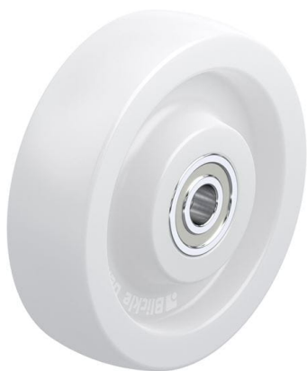
Wheel used SP0 175/20K