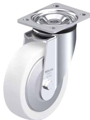
Corresponding swivel caster LK-SP0 175K-FA