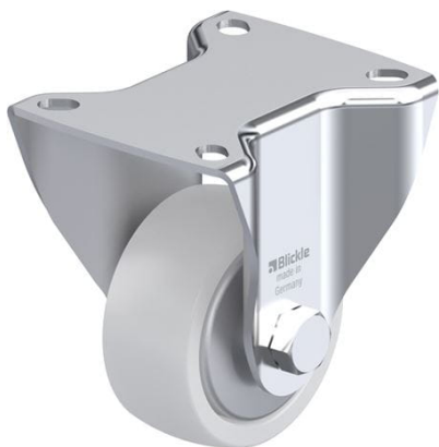
Corresponding rigid caster BK-SP0 75K-FA