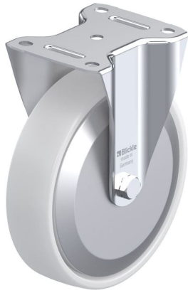
Corresponding rigid caster B-PO 200R-FA