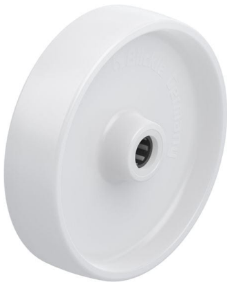
Wheel used PO 200/20R