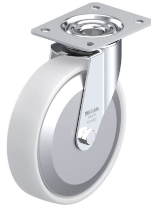
Corresponding swivel caster LE-PO 200R-FA