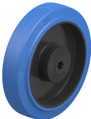
Wheel used POEV 200/12KA-SB