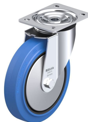
Corresponding swivel caster L-POEV 200KA-SB-FA