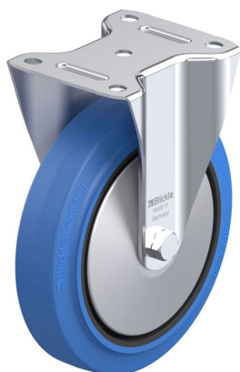
Corresponding rigid caster B-POEV 200KA-SB-FA