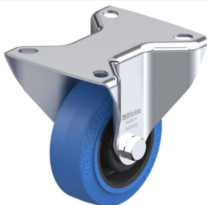
Corresponding rigid caster B-POEV 80R-SB