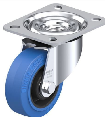
Corresponding swivel caster L-POEV 80R-SB