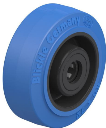
Wheel used POEV 80/12R-SB