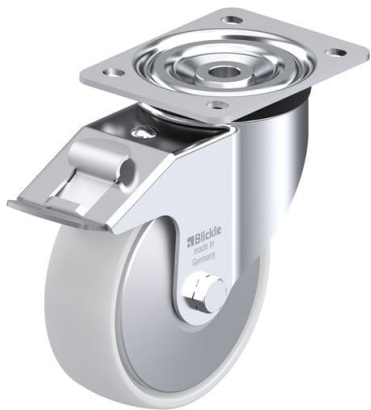
Corresponding standard locking L-PO 150XR-FI-FA