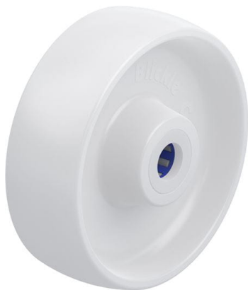
Wheel used PO 150/20XR