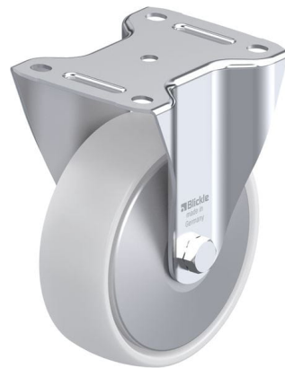
Corresponding rigid caster B-PO 150XR-FA