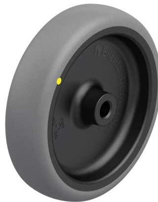
Wheel used TPA 100/8G-ELS