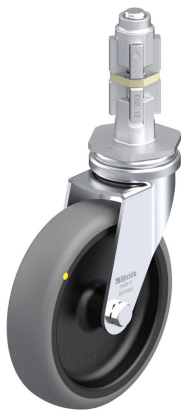
Corresponding swivel caster LRA-TPA 100G-ELS-E03