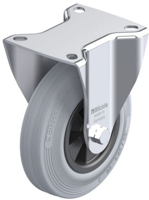
Corresponding rigid caster B-VPP 125G-SG