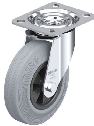
Corresponding swivel caster L-VPP 125G-SG