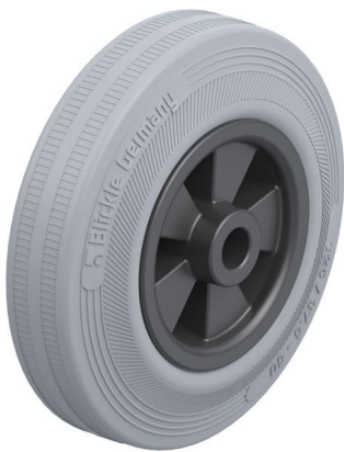
Wheel used VPP 125/12G-SG