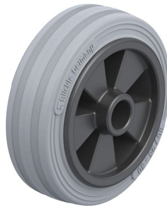
Wheel used VPP 80/12G-SG