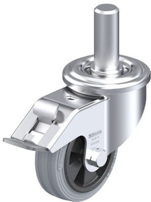
Corresponding standard locking LEZ-VPP 80G-FI-SG