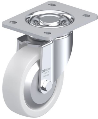
Corresponding swivel caster LH-SP0 125G-3-FA