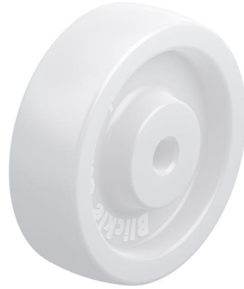
Wheel used SP0 125/15G