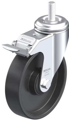
Corresponding standard locking LKRA-POA 125K-FI-GS12