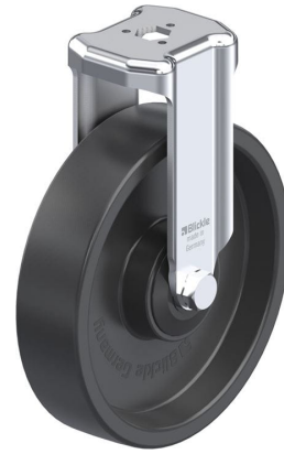
Corresponding rigid caster BKRA-POA 125K