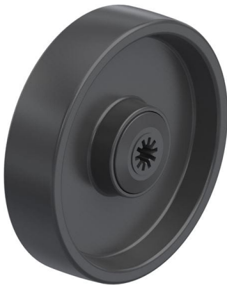
Wheel used POA 125/8K