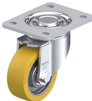
Corresponding swivel caster LH-GTH 100K-3