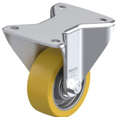
Corresponding rigid caster BH-GTH 100K-3