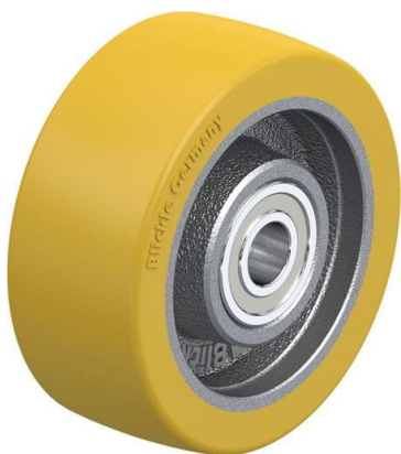
Wheel used GTH 100/15K