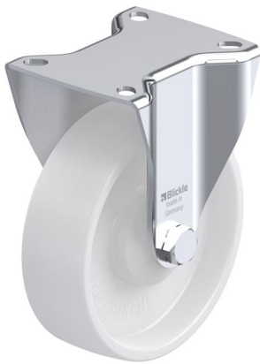
Corresponding rigid caster BK-PO 125KA-1