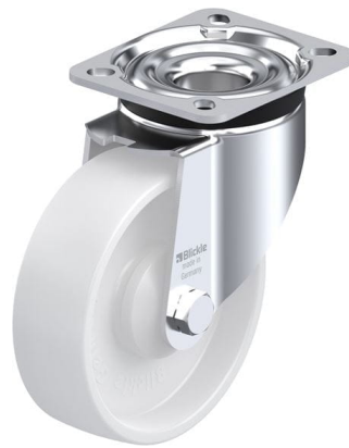
Corresponding swivel caster LK-PO 125KA-1