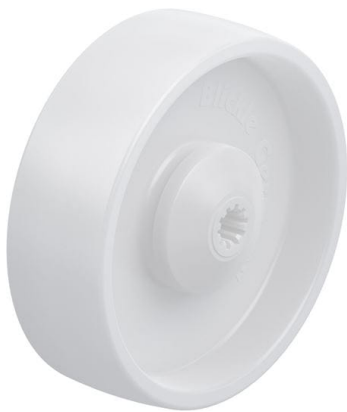
Wheel used PO 125/10KA