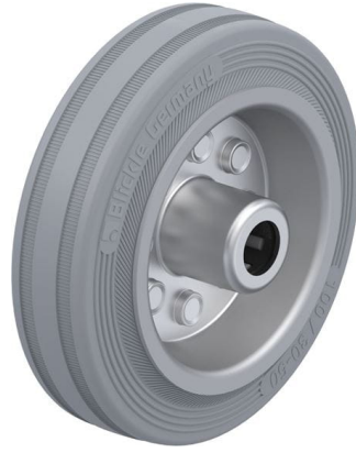
Wheel used VE 100/12R-SG