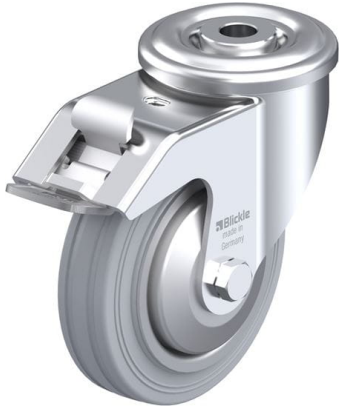
Corresponding standard locking LER-VE 100R-FI-SG-FA