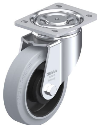
Corresponding swivel caster LH-POEV 160KA-SG