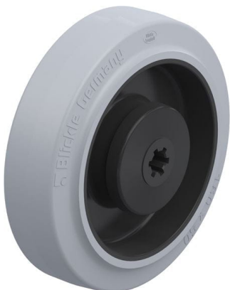
Wheel used POEV 160/12KA-SG