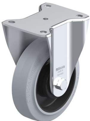
Corresponding rigid caster BH-POEV 160KA-SG