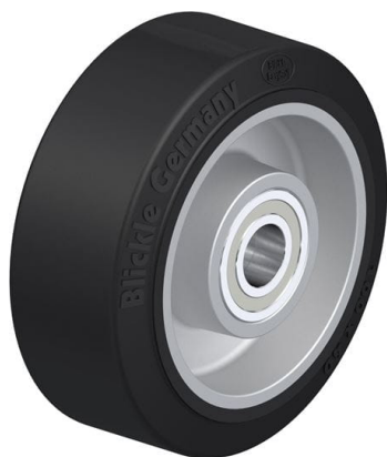
Wheel used ALEV 100/15K