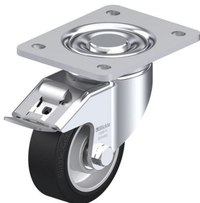
Corresponding standard locking LH-ALEV 100K-3-FI