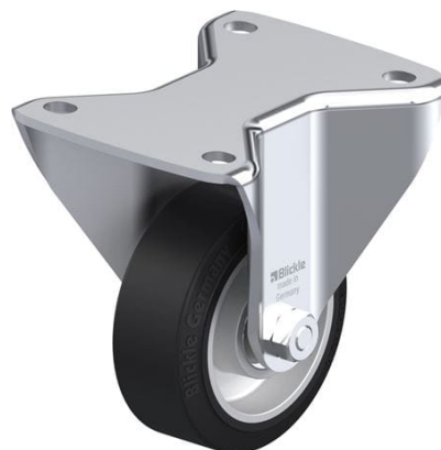
Corresponding rigid caster BH-ALEV 100K-3