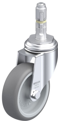
Corresponding swivel caster LKRA-TPA 101G-11-E12