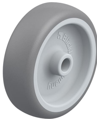
Wheel used TPA 101/12G