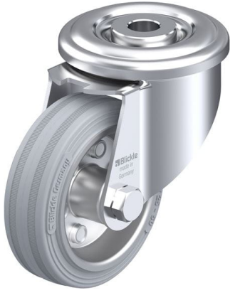
Corresponding swivel caster LER-VE 80R-SG