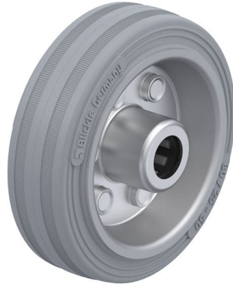
Wheel used VE 80/12R-SG