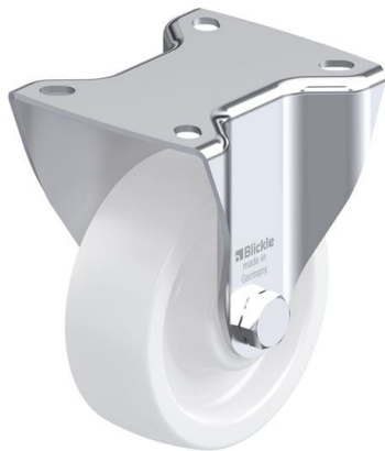
Corresponding rigid caster BK-SP0 100G-1