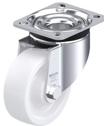
Corresponding swivel caster LK-SP0 100G-1