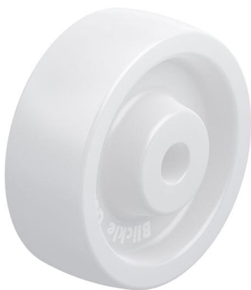
Wheel used SP0 100/15G