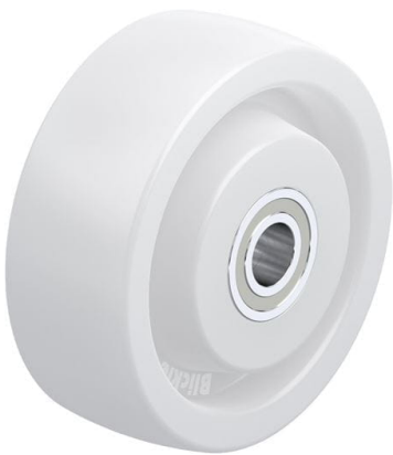
Wheel used SP0 100/15K