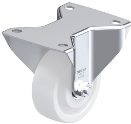
Corresponding rigid caster BK-SP0 100K-3