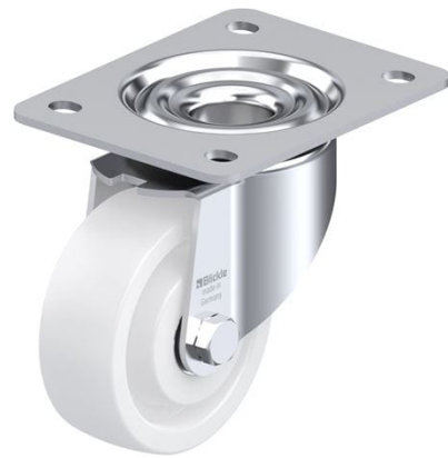
Corresponding swivel caster LK-SP0 100K-3