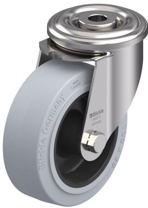
Corresponding swivel caster LEXR-POEV 100G-SG