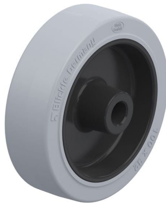
Wheel used POEV 100/12G-SG