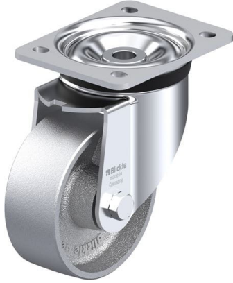
Corresponding swivel caster LK-G 127G