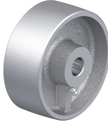
Wheel used G 127/20G