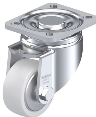
Corresponding swivel caster LH-SP0 75K-FA