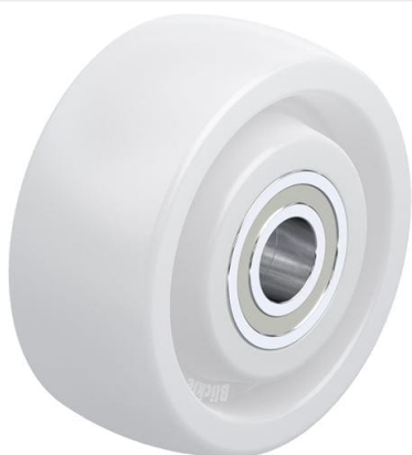
Wheel used SP0 75/15K