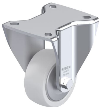
Corresponding rigid caster BH-SP0 75K-FA