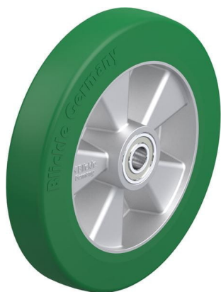
Wheel used ALST 250/20K