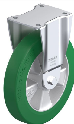
Corresponding rigid caster BH-ALST 250K