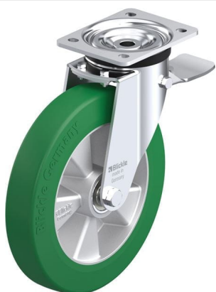
Corresponding standard locking L-ALST 250K-3-ST