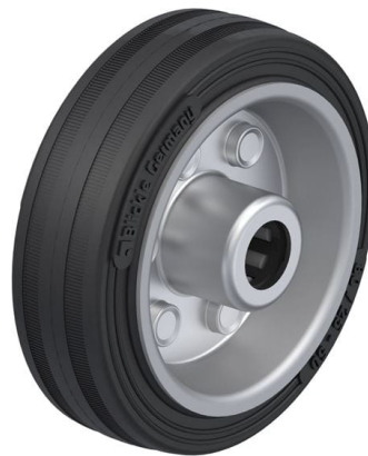
Wheel used VE 80/12R