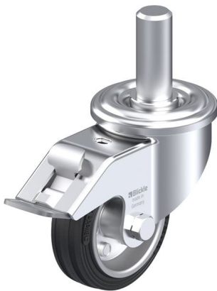
Corresponding standard locking LEZ-VE 80R-FI