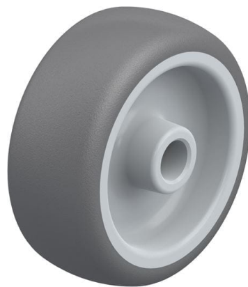
Wheel used PATH 80/12G