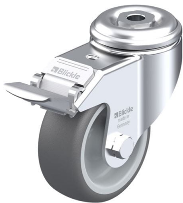
Corresponding standard locking LKRA-PATH 80G-11-FI