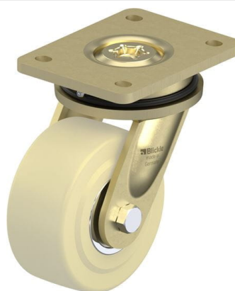
Corresponding swivel caster LS-GSP0 125K