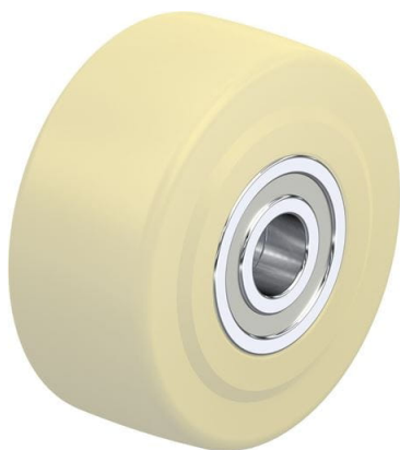
Wheel used GSP0 125/25K