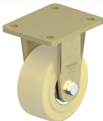
Corresponding rigid caster BS-GSP0 125K