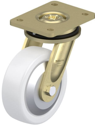
Corresponding swivel caster LS-SPO 150K-FA