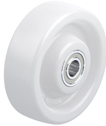
Wheel used SPO 150/20K