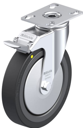
Corresponding standard locking LKPA-VPA 150K-FI-EL-FA