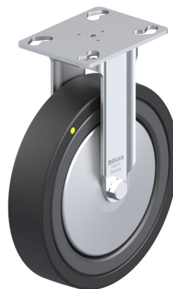
Corresponding rigid caster BKPA-VPA 150K-EL-FA