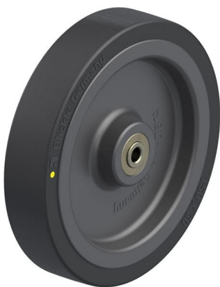
Wheel used VPA 150/8K-EL