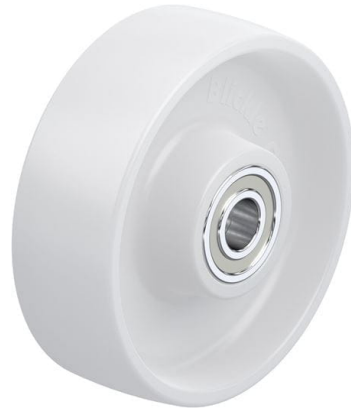
Wheel used PO 150/20K