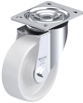
Corresponding swivel caster L-PO 150K