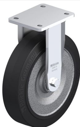
Corresponding rigid caster BO-SE 250K