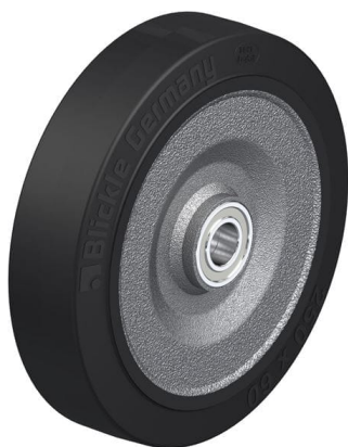
Wheel used SE 250/25K