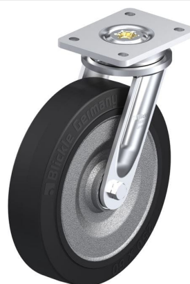
Corresponding swivel caster LO-SE 250K