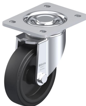
Corresponding swivel caster LH-POEV 125R-3