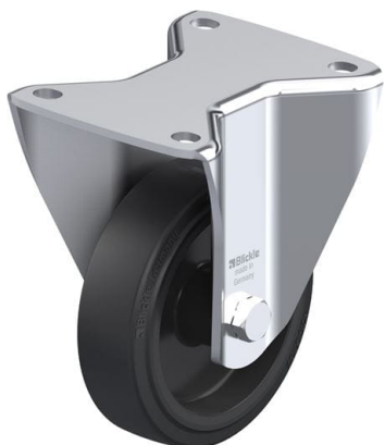
Corresponding rigid caster BH-POEV 125R-3