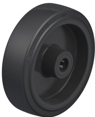
Wheel used POEV 125/15R