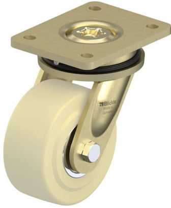
Corresponding swivel caster LS-GSP0 125K