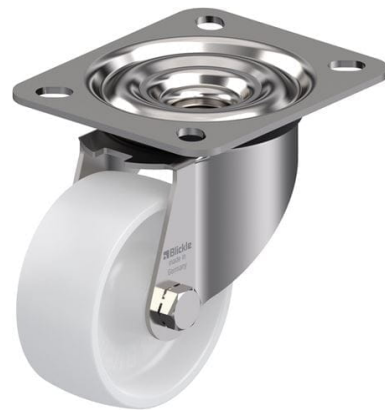
Corresponding swivel caster LEX-PO 75G