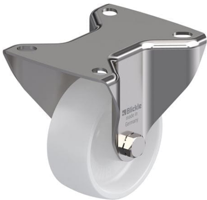
Corresponding rigid caster BX-PO 75G