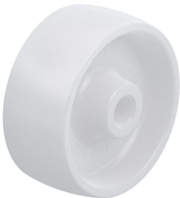
Wheel used PO 75/12G