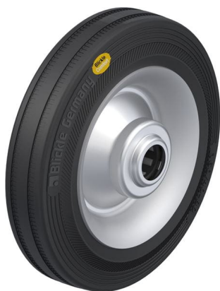
Wheel used RD 162/20R