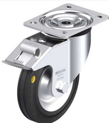
Corresponding standard locking L-RD 162R-FI