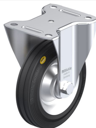
Corresponding rigid caster B-RD 162R