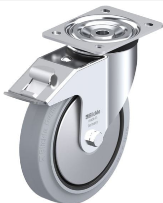
Corresponding standard locking L-POEV 200R-FI-SG-FA