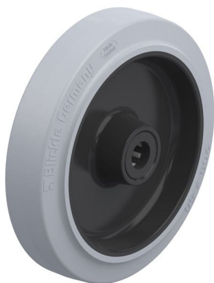
Wheel used POEV 200/20R-SG