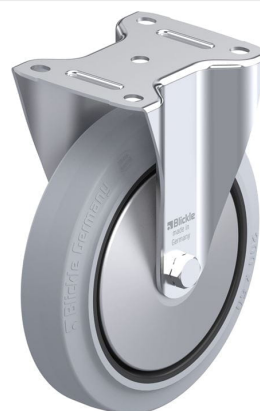
Corresponding rigid caster B-POEV 200R-SG-FA